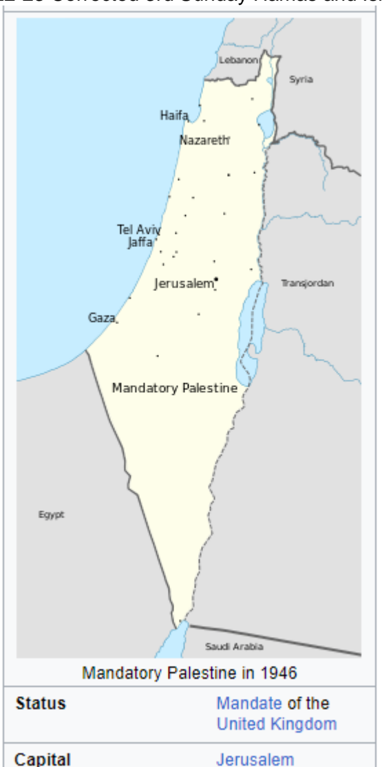
10-22-23 Corrected 3rd Sunday Hamas and Israel War. Year A Page 19 of 40